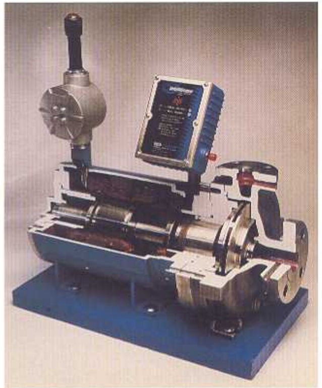
Chempump NC Series Cut-Away